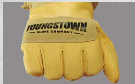
Goat Grain Leather