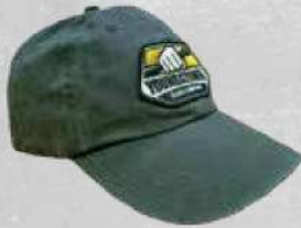
BALL CAP ITEM# 03-1285-80-B