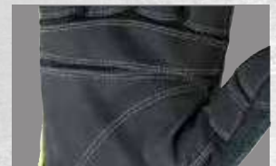
Non-slip Palm Reinforcement