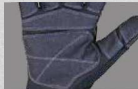
Non-slip Palm Reinforcement