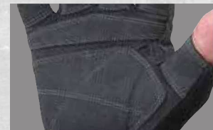
Non-slip Palm Reinforcement