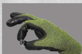
Superior Grip in Oily Conditions