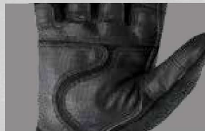
Heavy Duty Non-slip