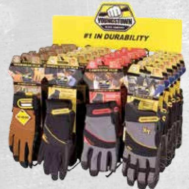
COUNTER DISPLAY ITEM# 101 Holds 24 Pairs of Gloves Also can be hung on Pegboard or Slatwall