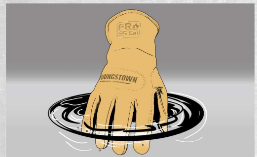
Waterproof Windproof Insulated