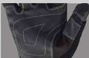
Supersaddle Palm Reinforcement