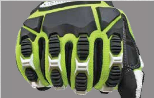
TPR Impact Protection