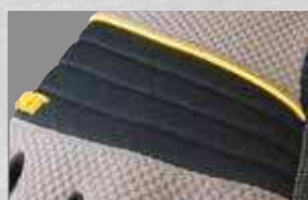
Accordion-style Knuckle Protection