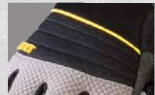
Accordion-style Knuckle Protection

ANTI-VIBE XT SKU # 03-3200-78 SIZES: S-2XL