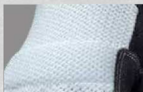
Cool Mesh Top