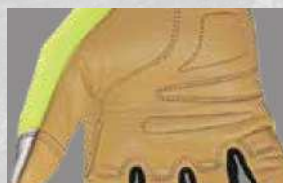
Goat Grain Leather