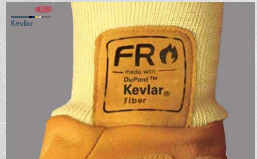
Kevlar® Wristlet and Liner