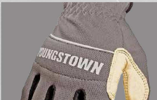
Breathable Top of Hand

Combines the innovation of advanced synthetic materials with the classic feel of traditional leather on the palm. This hybrid model is the best of both worlds and ideal for lighter duty work where comfort, dexterity and breathability are a required.