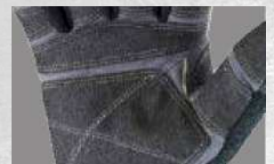
Heavy Duty Non-slip