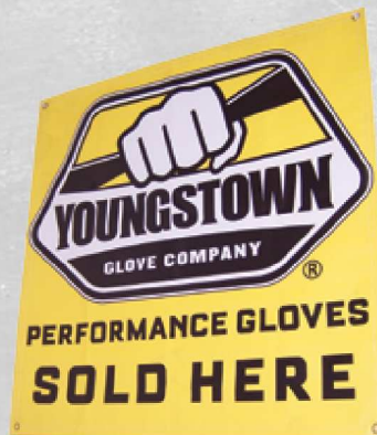
BANNER ITEM# 106