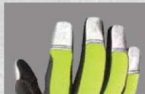
Reflective 3M™ Scotchlite™