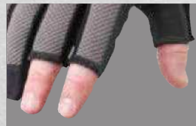
True Fingertip Dexterity