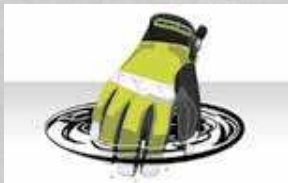
Waterproof Windproof Insulated