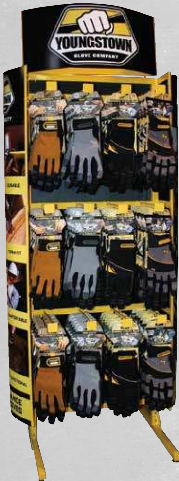
FLOOR DISPLAY ITEM# 115 DOUBLE-SIDED to hold up to 144 Pairs