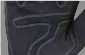
Synthetic Suede Palm