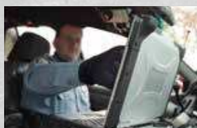
Ideal for On-The-Go Professionals