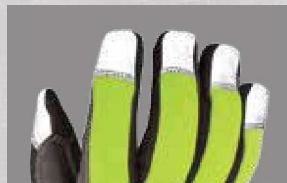
Reflective 3M™ Scotchlite™