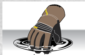
Waterproof Windproof Insulated