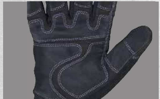
Heavy Duty Non-slip