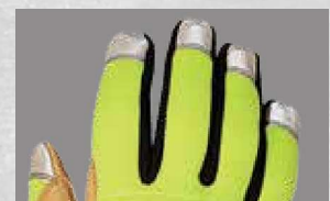
Reflective 3M™ Scotchlite™