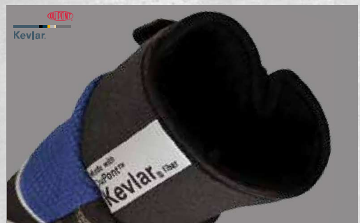
Warm Microfleece Layered over Kevlar® Liner