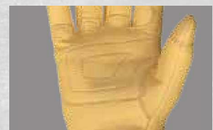
Double Leather Reinforcement