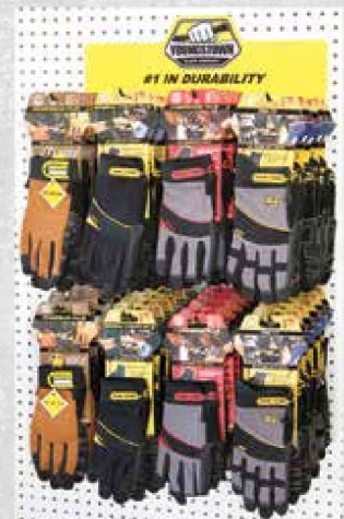
HANGING DISPLAY ITEM# 101 Holds 48 Pairs