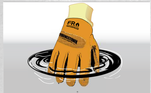
Waterproof Windproof Insulated