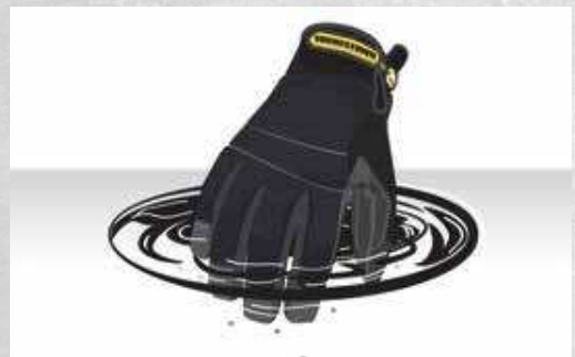
Waterproof Windproof Insulated