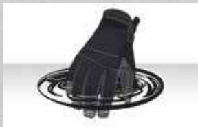
Waterproof Windproof Insulated