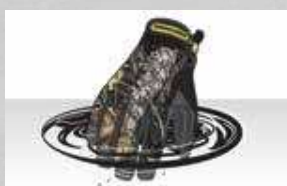
Waterproof Windproof Insulated

Mossy Oak Break-Up Thinsulate INSULATION