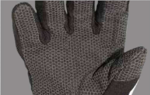
FR Palm made with Schoeller®