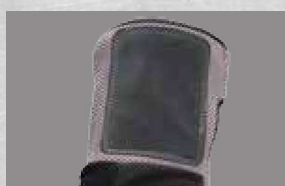
Extended Reinforced Cuff

HEAVY UTILITY XT SKU # 04-3500-70 SIZES: S-2XL