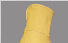
4" Safety Cuff

Our original performance leather glove designed for superior dexterity and durability to increase comfort, efficiency and safety for workers. Made of high quality goat grain leather and sewn into an ergonomic, 3D glove pattern. Features a double layering in critical wear areas and a 4" safety cuff. Unmatched quality, comfort and dexterity.