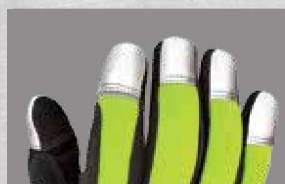
Reflective 3M™ Scotchlite™